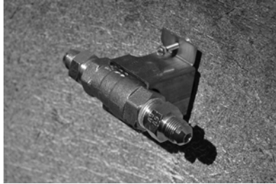
Key Valve Assembly (Inside View)

5. Check all gas connections tight, position the burner assembly so that it sits level in the bowl. Rotate as required so that the gas hose rests in a compact position.