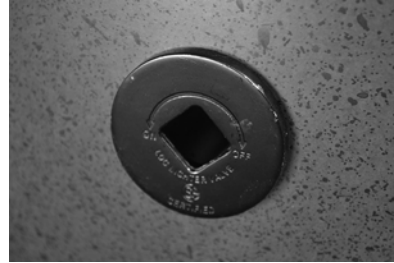
Key Valve Assembly (Outside View)

NOTE: Leak Test – it is highly recommended to perform a gas leak test at this point in the install. Turn on the gas supply and then, using a soapy water solution spray on the gas line connections to ensure no leaks exist.