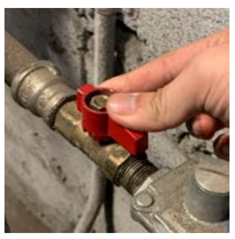
2. Turn gas supply valve to fire pit to the ON position. Ensure the ON/ OFF Knob is in center/middle position with the arrows aligned.