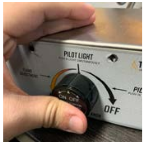
5. Once lit, continue to push in valve knob for 20 seconds to heat the thermocoupling.