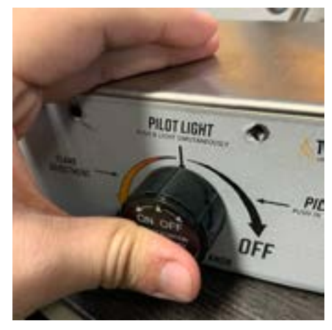
3. Push in the ON/OFF knob to activate the gas valve and allow the gas to flow.