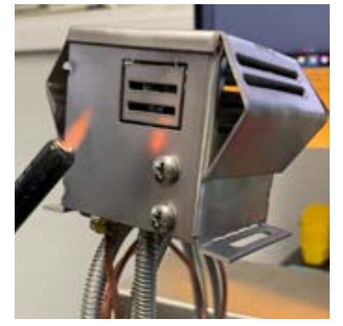
4. While depressing and holding the valve knob, take a kitchen lighter and safely ignite the gas coming out of the pilot.