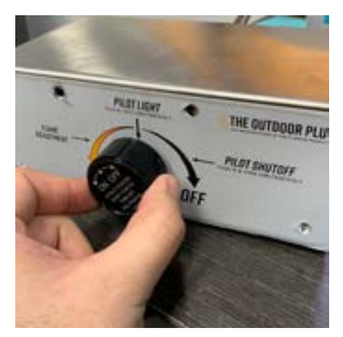
6. Turn the ON/OFF knob counterclockwise to light main burner. NOTE: If the burner fails to light, wait 5 minutes for gas to clear, then repeat steps 2-6.