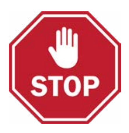
1. STOP! Read the safety information and warnings on pages 2 & 3 prior to operating the fire feature.

This product is not for use with small tanks. It is intended to be connected to fixed piping systems only.