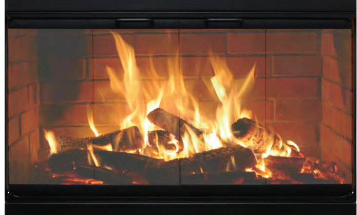
Only available in Textured Black

Base unit widths are 36, 38 and 42" wide and offer bronze tinted glass with a durable textured black powder coat finish (base unit refers to the door and frame with no spacers). For openings taller than the base height we incorporate a system of trim spacers , either a single or pair, that allow the door to fit a wide variety of openings and some of the industry's most popular models past and present.