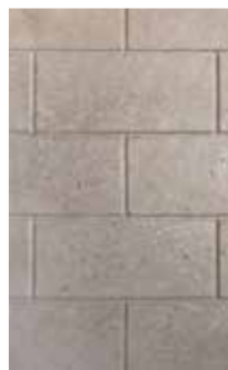
White Stacked Refractory Liners