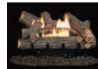
Crescent Hill HD